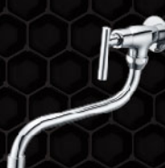
A53000/ SS02 F9