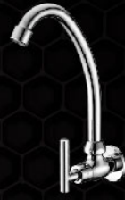
A51000/ ES01 F9