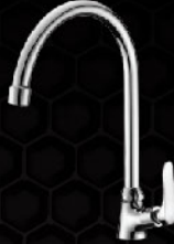
A52000/ HSS01 F11