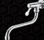
A53000/ SS02 F2