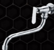
A53000/ SS02 F13