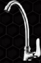
A52000/ ES01 F11