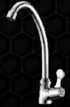
A52000/ ES01 F2