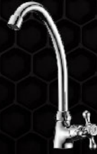
A52000/ ES01 T5