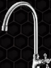
A52000/ HSS01 T5