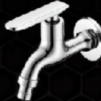
A11024 F13 A11024TQ F13