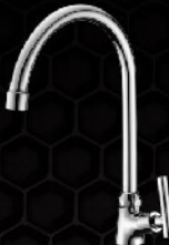
A52000/ HSS01 F9