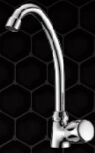
A52000/ ES01 E1

Pillar mounted sink tap c/w ear spout (ES01)