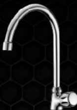
A52000/ HSS01 E1

Pillar mounted sink tap c/w ear spout (ES01)