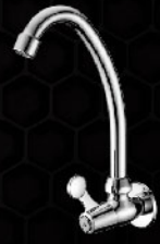
A51000/ ES01 F2