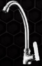
A52000/ ES01 F13