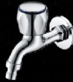
A11024 E1 A11024TQ E1

Wall flanged brass chrome hose bib tap c/w screw collar (3/4")