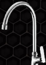
A52000/ HSS01 F13