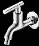
A11024 F9 A11024TQ F9