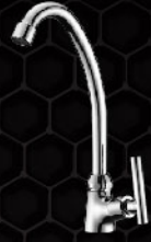
A52000/ ES01 F9