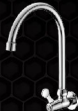
A51000/ HSS01 F2