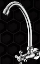
A51000/ ES01 T5