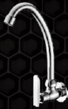
A51000/ ES01 F13