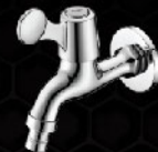
A11024 F2 A11024TQ F2