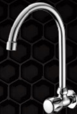
A51000/ HSS01 E1

Wall mounted sink tap c/w ear spout (ES01)