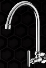
A51000/ HSS01 F9