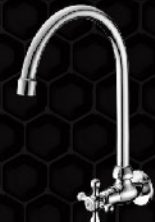
A51000/ HSS01 T5