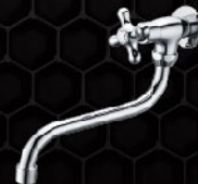
A53000/ SS02 T5