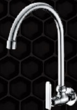
A51000/ HSS01 F13