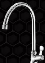
A52000/ HSS01 F2