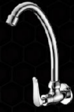
A51000/ ES01 F11