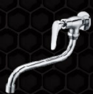
A53000/ SS02 F11