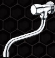
A53000/ SS02 E1

Wall flanged abluton tap c/w "S" spout (SS02) for 53000