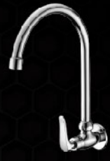
A51000/ HSS01 F11