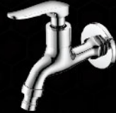
A11024 F11 A11024TQ F11