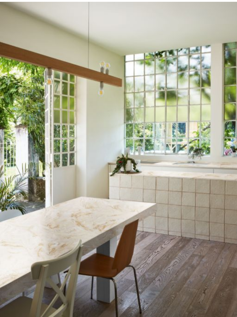
CORIAN® SOLID SURFACE DUNE PRIMA

Whether filled with the edgy energy of a cityscape, or road less traveled of the countryside, surfaces can recall your journey and are elemental to making your space tell its own story. The trend is for surfaces to offer a sense of a voyage. Highly varied styles can be as simple as a concrete look, offer the unusual movement of exotic materials, or suggest a landscape of wonder.