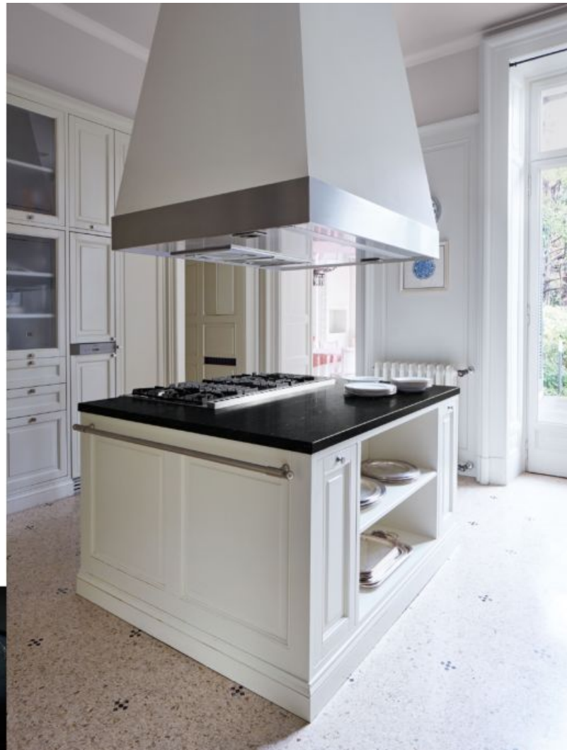
CORIAN® SOLID SURFACE COCOA PRIMA