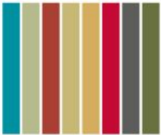
CORIAN® SOLID SURFACE LIMESTONE PRIMA