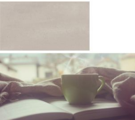
CORIAN® QUARTZ NEBULA